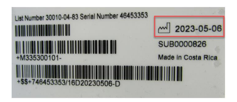
Figure 1. Sample label showing Manufacturing Date in the red box – date format is shown in YYYY-MM-DD

This issue affects all Plum 360 pumps manufactured between July 2020 and December 2021. The manufacturing date is shown on the Product Identification label on the side of the pump, as shown in Figure 1 below.