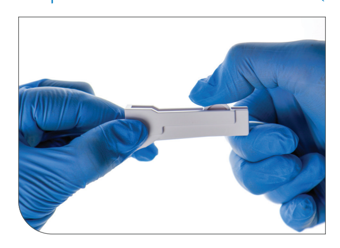
Close flow control clamp of administration set.