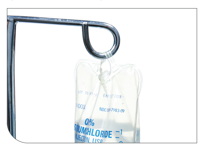
Suspend container from hanger.