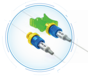
All-Purpose Catheter: 3Fr, 6 cm