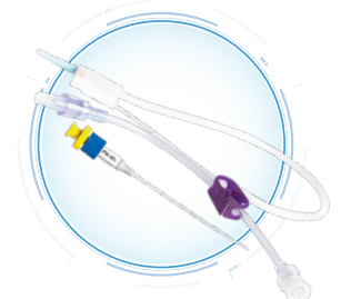
Rapid Exchange Catheter