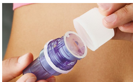
Twist cap to remove.