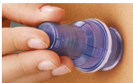
Insert the cannula. Press device firmly until you hear a click, then maintain for at least 5 seconds. Gently pull off the applicator.