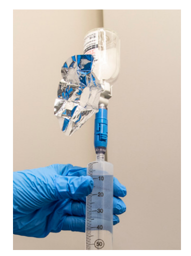
Withdrawing 5FU with ChemoLock CSTD

This testing was conducted at ICU Medical, Inc., San Clemente, CA, in a class IV biological safety cabinet (BSC) as required by USP for the compounding of hazardous drugs. Each CSTD system included a syringe adapter component, a ChemoLock injector, and a vial adapter with an access ChemoLock port.