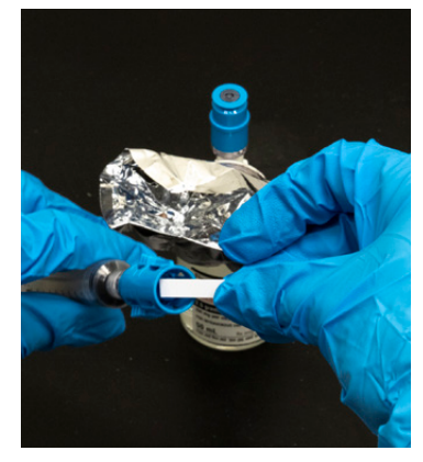
Testing ChemoLock injector with wet litmus paper