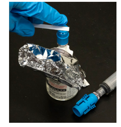
Testing ChemoLock port with wet litmus paper

All functions were performed wearing nitrile gloves.