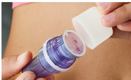
Twist cap to remove.