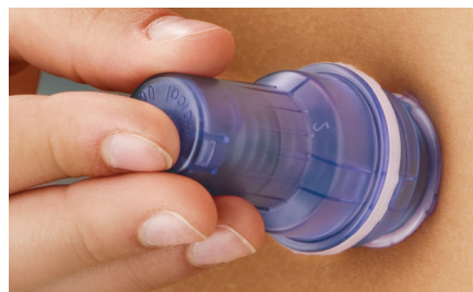
Insert the cannula. Press device firmly until you hear a click, then maintain for 5 seconds. Pull straight off.