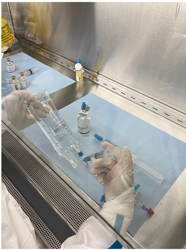
Figure 2: Compounding activities inside the BSC, prior to HD sampling activities.

The sample was then analyzed by liquid chromatographytandem mass spectrometry (LC-MS/MS), as previously described