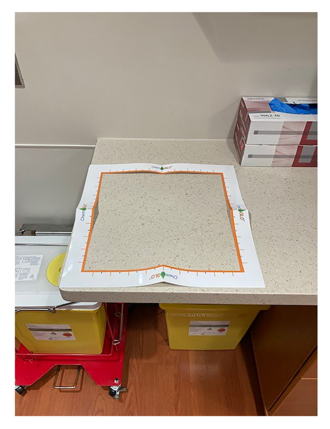
Figure 3: HD sampling area of the nursing staging area.