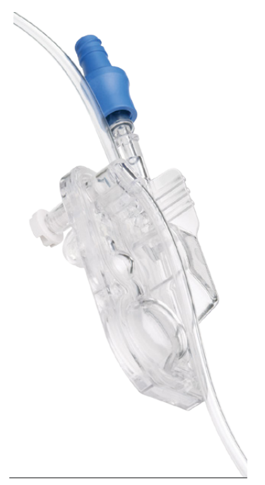
The PlumSet cassette allows for the clearing of air using a backpriming feature to maintain a totally closed system throughout chemotherapy administration.

Disconnecting and priming air through the infusion line can have safety and financial implications. First, a disconnected line may expose the patient and clinician to a hazardous drug. Second, when clearing takes place by disconnecting and priming the line, medication intended for the patient is lost, potentially resulting in inaccurate dosing and cost to the facility. The unique capability of the Plum 360 to remove air from an infusion without disconnecting the line may minimize hazardous drug exposure and medication waste.