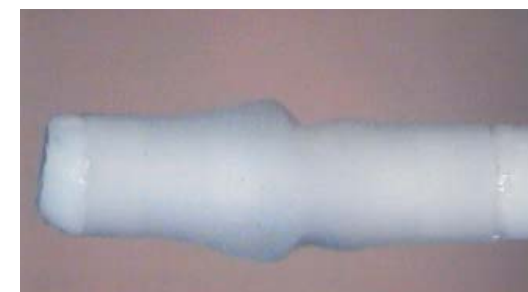
Balloon conformity after 1 inflation.