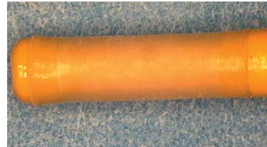
Balloon conformity after 1 inflation.