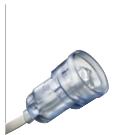
Easy-to-use "telephone style" cable connection