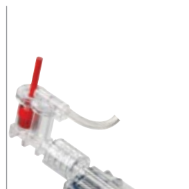
Two proven continuous flush devices to choose from Intraflo® flush