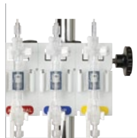
Patient or pole mounting for clinical flexibility