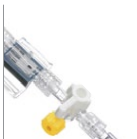
Clear fluid pathway facilitates setup and priming